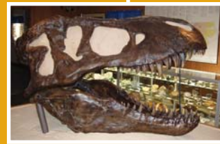
Tyrannosaurus Rex life-size skull replica