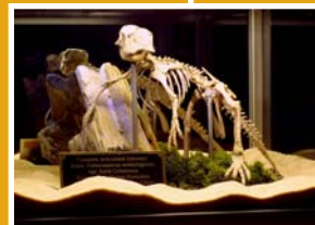
Baby Psittacosaurus Dinosaur