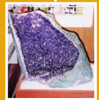
Amethyst Geode from Brazil